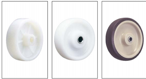
N: Polyamide wheel NWB: Polyamide wheel (w/ Bearing) UWB: Polyurethane wheel (w/ Bearing)